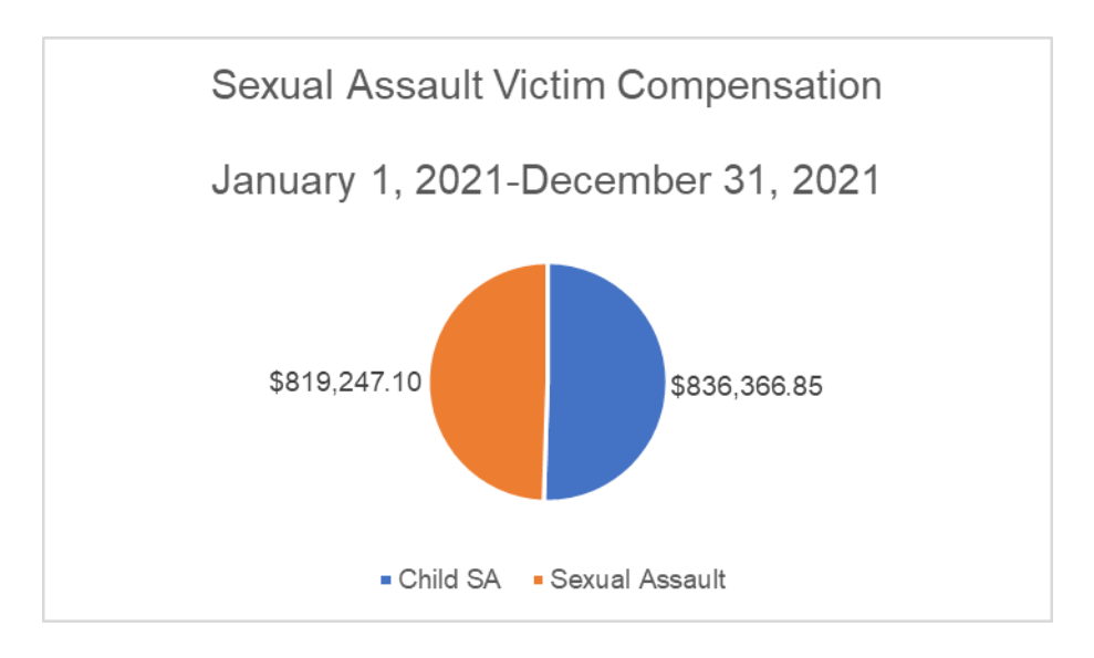
Figure 2. Sexual Assault Victim Compensation, 2021 ■