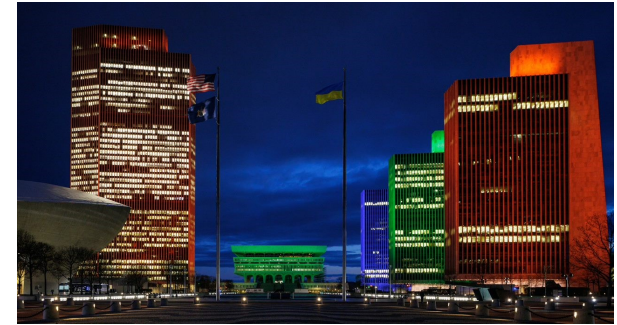
The Empire State Plaza illuminated for NCVRW.

To see community awareness projects and events coordinated across the nation in celebration of the 2022 NCVRW, visit the U.S. Department of Justice's Office for Victims of Crime. Governor Kathy Hochul issued a NCVRW proclamation and for the first time, directed that state landmarks be illuminated blue, green and orange – the colors designated for NCVRW – the evening of April 27 to recognize the importance of victims' rights and access to justice.